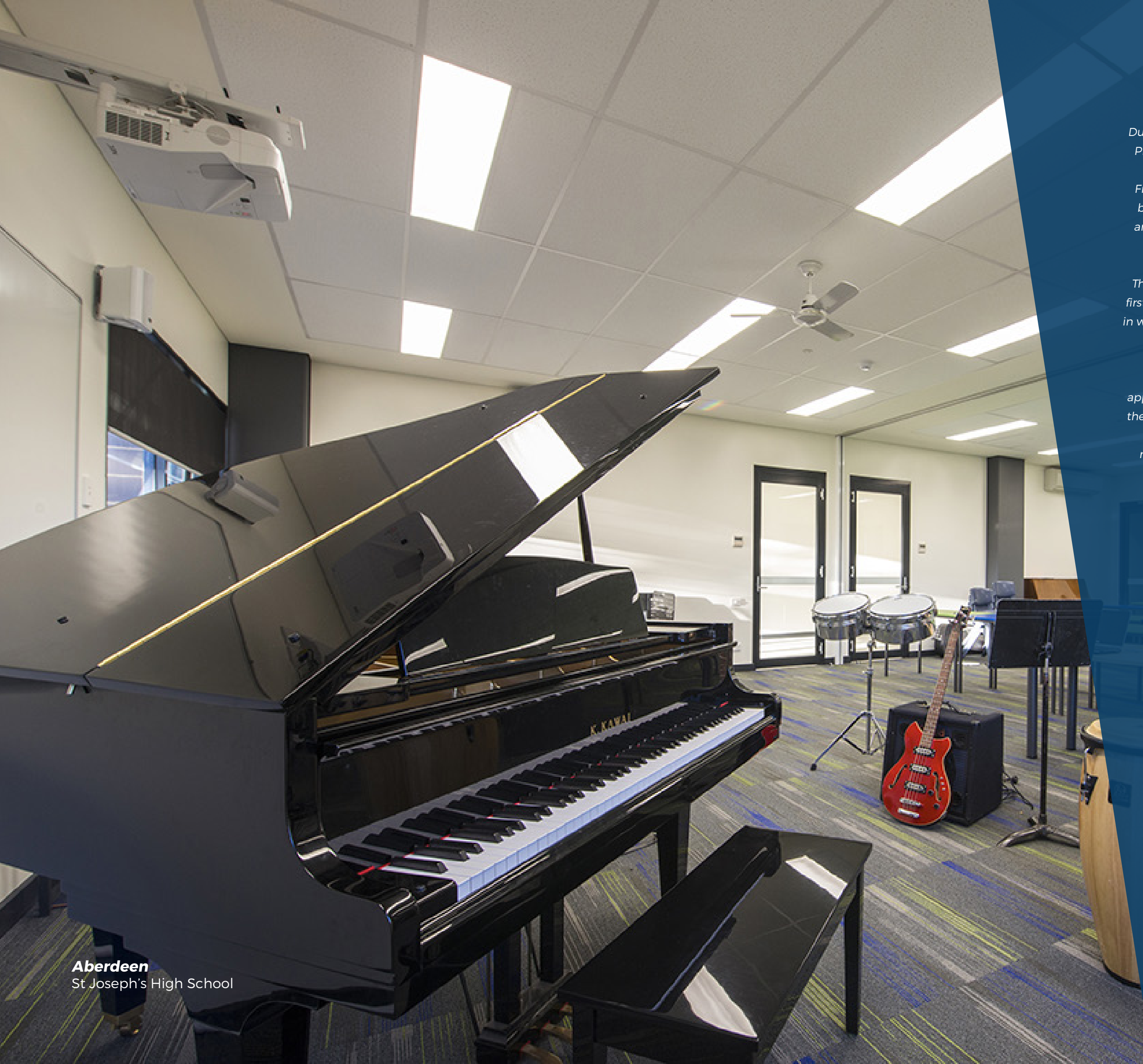
Aberdeen St Joseph's High School